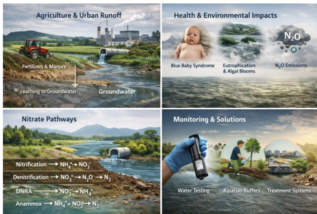
Image 1: Conceptual overview of nitrate impurity sources, transformation pathways, impacts, and mitigation in aquatic systems

1.2 Environmental Chemistry Framework- On the basis of environmental chemistry, the presence of nitrates in Indian groundwater is indicative of the overprinting of anthropogenic nitrogen loading on a geochemically regulated basis water structure. The natural hydrochemical structure is characterised by rock-water interaction, mineral dissolution-evaporation, and ion exchange and is largely exhibited by nitrate in oxic aquifers with a low denitrification capacity (Ali et al. , 2024; Murthy et al. , 2024). Multivariate statistical analysis and hydrochemical facies patterns are always consistent regarding the control of nitrate distributions by the intensity of land use, the state of recharge, and the lithology of the aquifer (Pareta, 2024; Pal et al. , 2024).